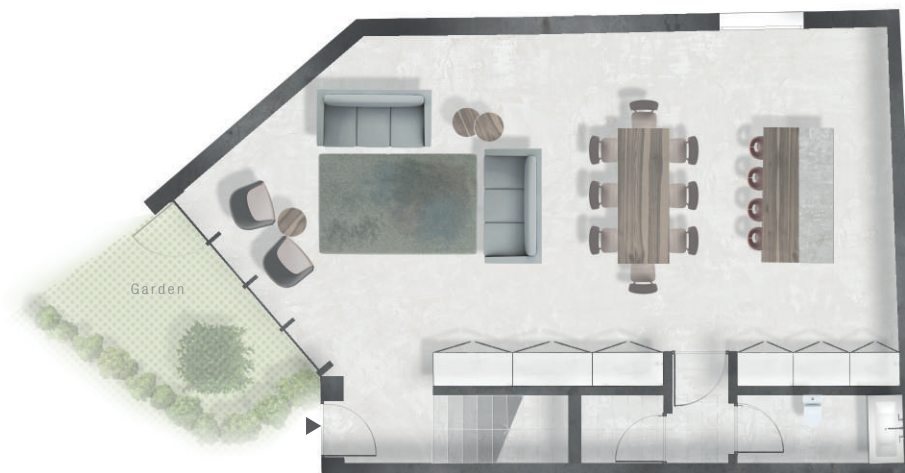
Ground floor www.prateato.pt

As áreas aqui apresentadas são aproximadas, indicativas e sem caráter contratual. The presented areas are approximate, indicative and have no contractual nature. As peças de mobiliário não estão incluídas no preço. Furniture not included in price.