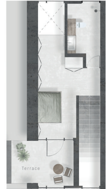
2nd floor www.prateato.pt

As áreas aqui apresentadas são aproximadas, indicativas e sem caráter contratual. The presented areas are approximate, indicative and have no contractual nature. As peças de mobiliário não estão incluídas no preço. Furniture not included in price.