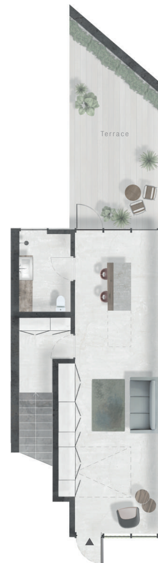
Ground floor www.prateato.pt

As áreas aqui apresentadas são aproximadas, indicativas e sem caráter contratual. The presented areas are approximate, indicative and have no contractual nature. As peças de mobiliário não estão incluídas no preço. Furniture not included in price.