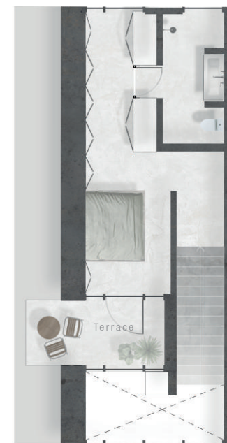
2nd floor www.prateato.pt

As áreas aqui apresentadas são aproximadas, indicativas e sem caráter contratual. The presented areas are approximate, indicative and have no contractual nature. As peças de mobiliário não estão incluídas no preço. Furniture not included in price.