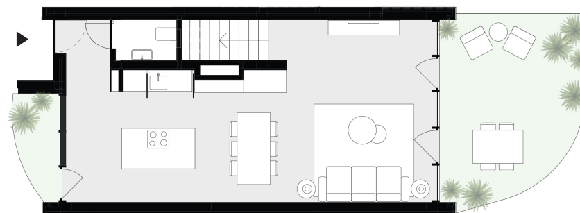
PISO 0 floor 0